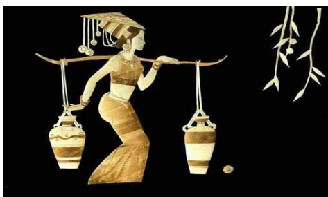
Picture7: The woman winemaking picture

Straw paintings about this theme of characters mainly include historical figures who revered by people, fairy, fairy tales, or the common work scene of labors. As shown in picture7 a beautiful woman, carrying two altar of food, enjoys a good mood. This kind of description of labor scene fully expressed the labor's pure goodness deep in their spiritual world.